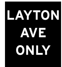
SPECIFIC TEXT INSTRUCTIONS

Motorists should be attentive to tunnel lane control signs as they are enforceable traffic control devices. Motorists can receive citations from law enforcement if they do not obey these signs.