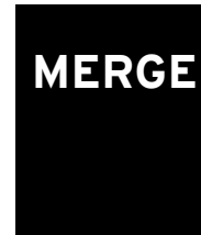
MERGE INTO DIFFERENT LANE